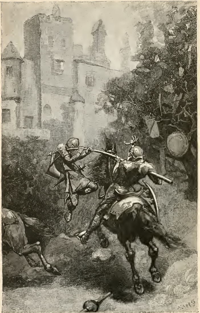
How Sir Turquine bare Sir Ector clean out of his Saddle.